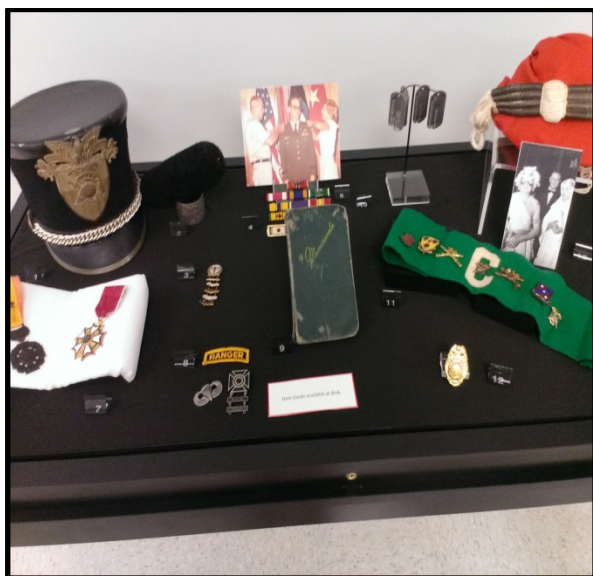
Warriors with Words and Faith exhibit case, Albert Gore Research Center

Objectives: To introduce students to primary sources to show how we can use sources to infer and learn about people and history.