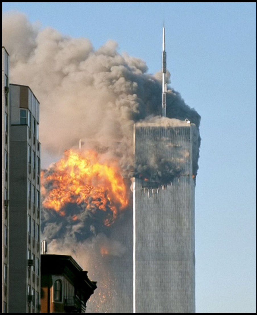
World Trade Center on September 11, 2001