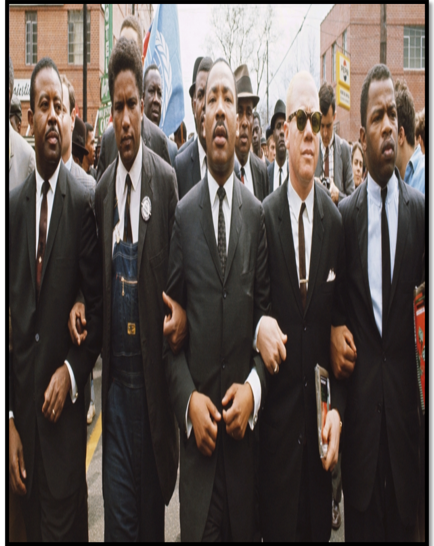
Martin Luther King, Jr. 1965 Selma March