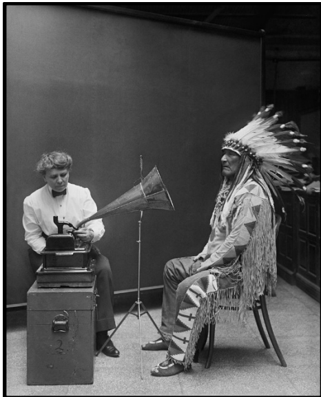
Frances Theresa Densmore with Blackfoot Chief, Mountain Chief (1916)

Objective: Introduce students to oral histories. Students will be able to identify and understand the difference between written and oral history. Students will understand the methods and uses behind oral histories.