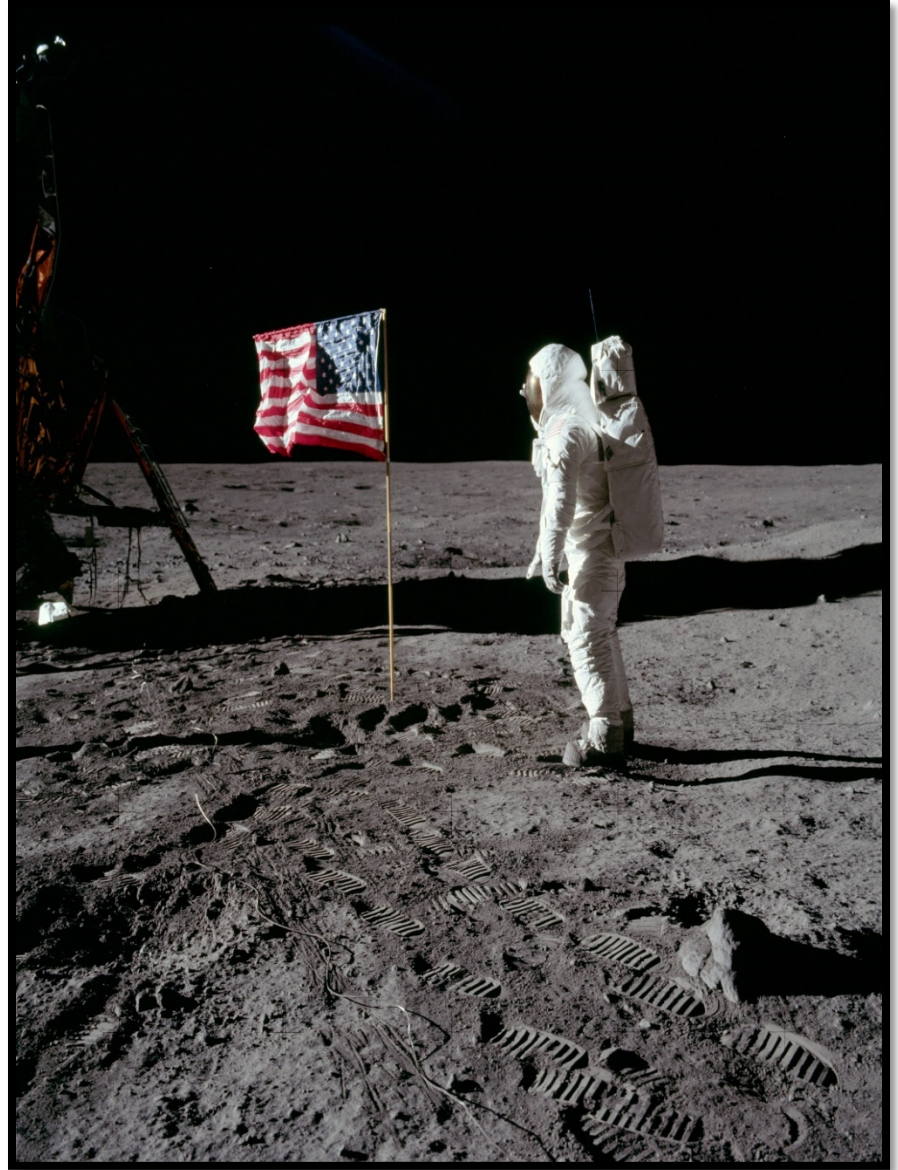
Buzz Aldrin, Moon Landing, 1969